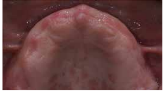
Figs. 1 & 2