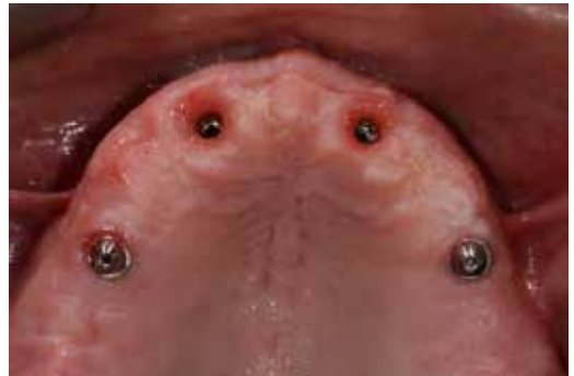
Figs. 5 & 6