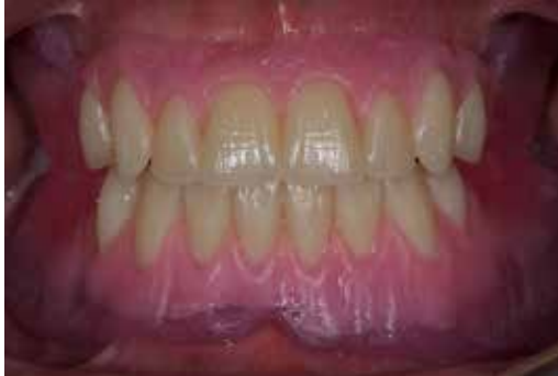
Fig. 3 Try-in of the dental set-up modeled on the established vertical dimension of occlusion according to functional and esthetic parameters.