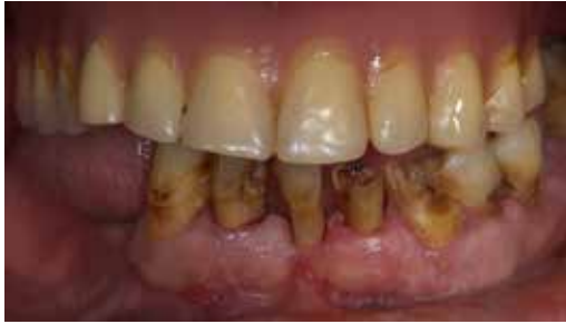
Fig. 2 Intra-oral photograph three months after tooth extractions.