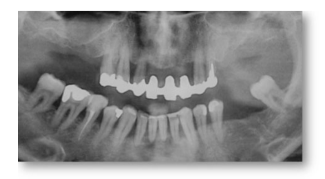
Fig. 1 Pre operative OPG of hopeless teeth

From each impression, a wax setup was developed and a dental-supported provisional prosthesis was customized